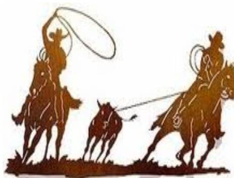
Continuing the tradition of the Chamber Classic

Pick 1 & Draw 1 or Draw Both Can Enter 2 times. $60/girl